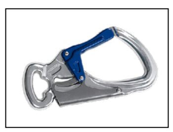
IKV 11 (EN 362:2004-T)